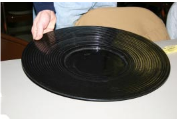
Flat pan used in World Gold panning Championships