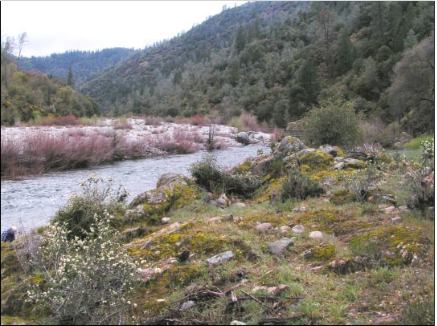
This is the area of our last stop and where we found lots of fine gold.