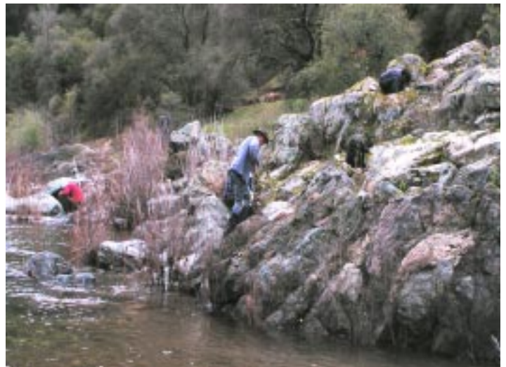
Working on the bedrock of the fine gold area.