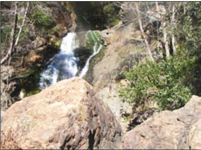
Part of Codfish Falls