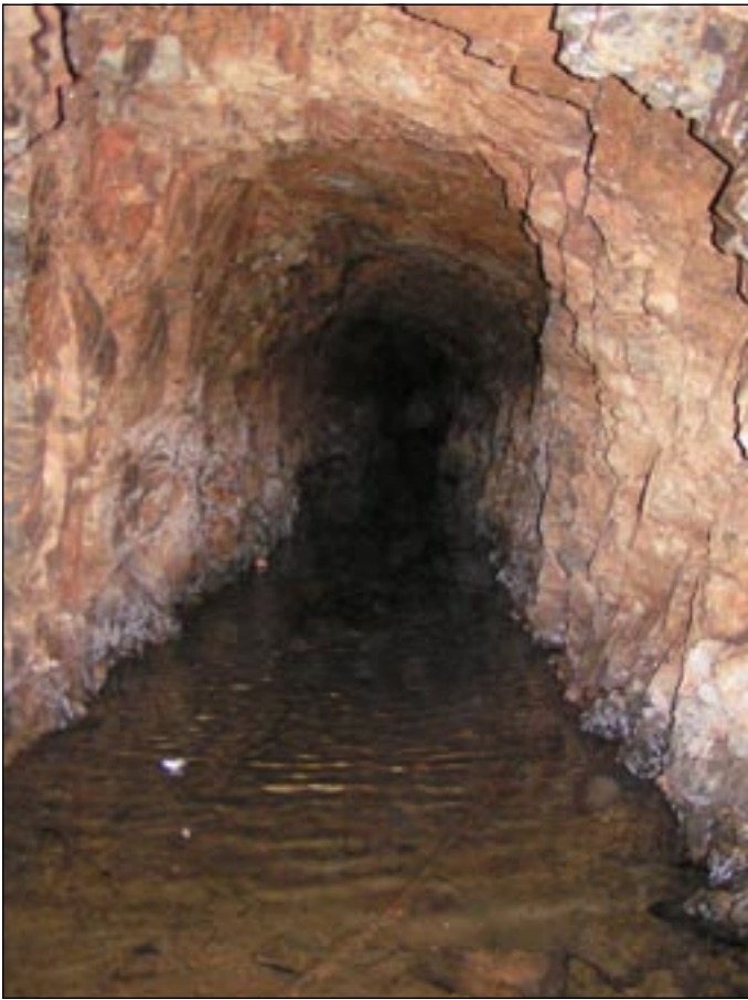
The first tunnel we located at the house site Merle knew about. The portal had partially collapsed backing up the water. We'll have to prospect this later.