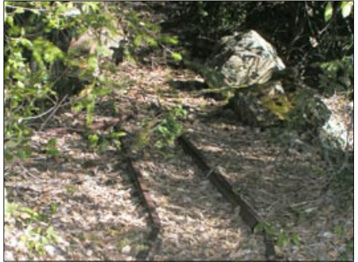
tracks into one of the tunnels