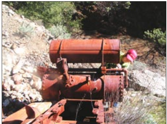
Old air compressor at the mine site