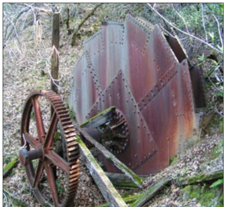
We found this mill on a subsequent trip as a followup. perhaps one of you out there knows what this is and how it operated. Would sure like to know!