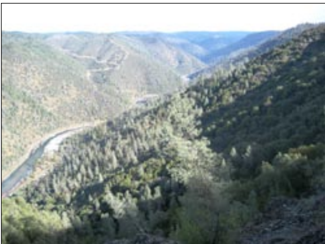
From the mountainside we were hiking, this was the view of the North Fork of the American. You can see a road on the upper left. This goes down to the Ponderosa Bridge from the Weimar side and goes over to the Foresthill Divide main road. It turns out we had passed the old mill we were looking for some distance back. It was down lower than we anticipated. We finished this trip without finding the old mill, but a subsequent trip did locate it. It is the picture just to the right!